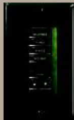
DecoFlex Single to 5 channel WireFree™ RTS wall switch available with customized labeling options