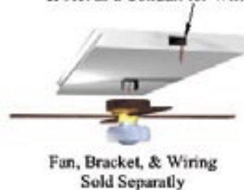
Factory Installed Fan/Light Beam Used to Support Heavy Fans/Lights & Act as a Conduit for Wiring

This allows you to hang a ceiling light or fan. When installing, run electrical wire through the beam and secure light or fan to beam. Beam is installed into the panel at the factory. Place this panel where desired.