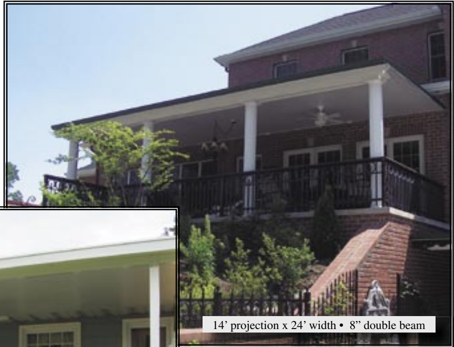
14' projection x 24' width • 8" double beam