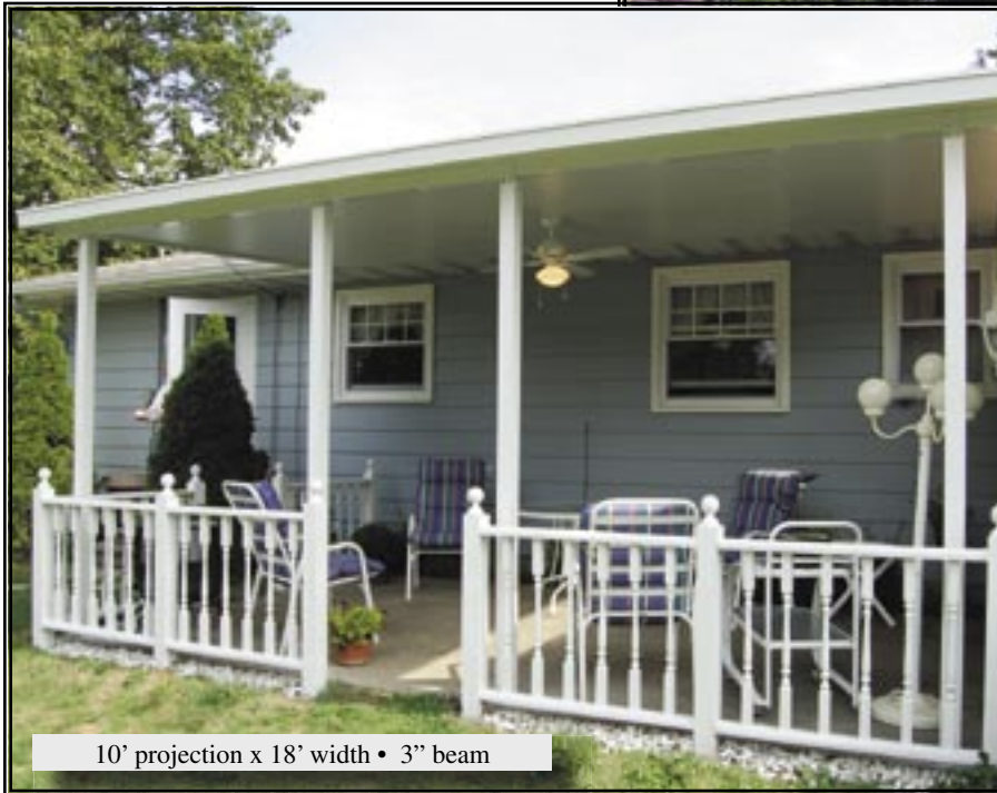
10' projection x 18' width • 3" beam